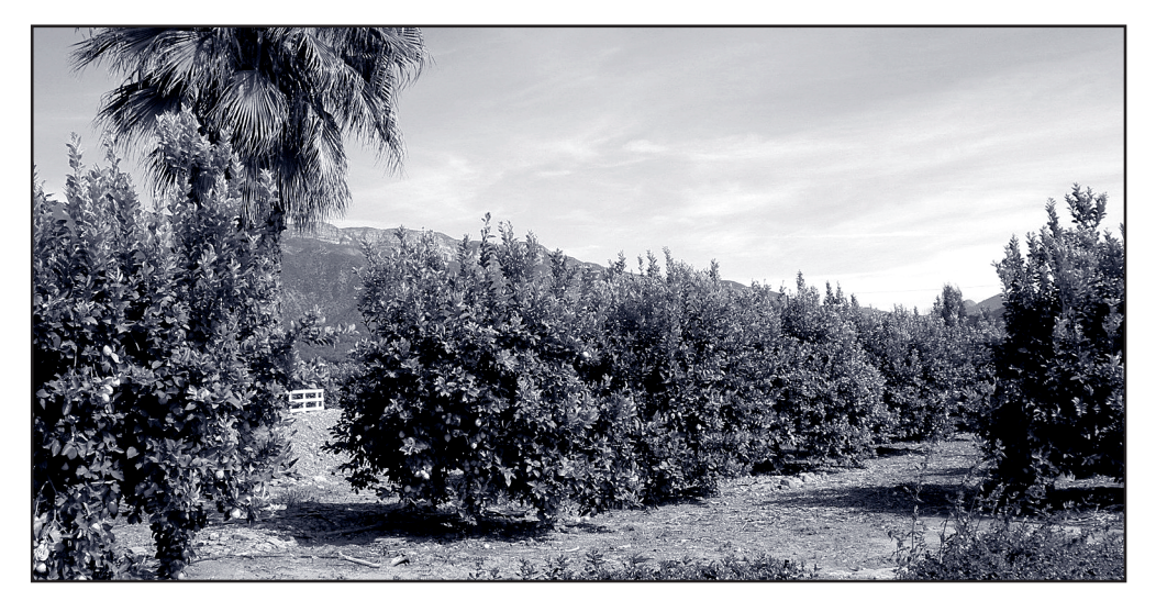
Farmers tend to irrigate very efficiently because their livelihood depends upon it. Water is a major cost factor in their business and watering requires careful ongoing management.

The SWEAP program would assist those agricultural customers that are using between 3.3 acre-feet to 6 acrefeet of water per planted acre within a given year.