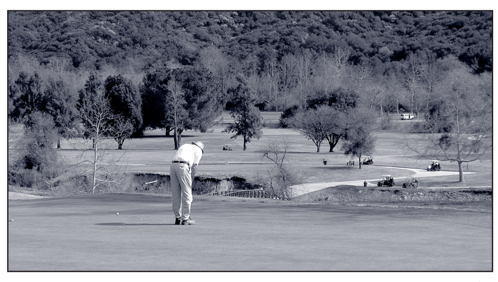
Lake Casitas has done much to make the arid Ojai Valley a greener place in which to live. The Soule Park Golf Course opened in 1962, after the Casitas Dam was constructed in 1958. Before the creation of Lake Casitas, even a minor drought meant that water had to be trucked into the Ojai Valley.

Monday, June 19 Casitas Water Adventure Open Daily